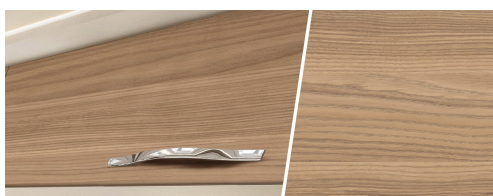
+ Wood décor Ashton