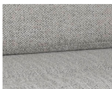
+ Upholstery Samir