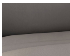
+ Collin real leather upholstery *