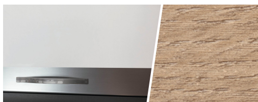
+ Amber Oak wood décor