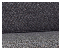
+ Melia upholstery *