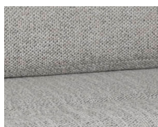
+ Samir upholstery