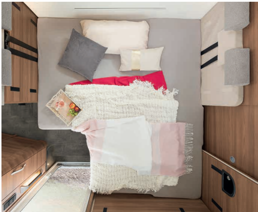
» Quick seating group conversion to an additional sleeping place