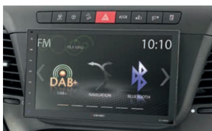
» Multimedia: Dethleffs Naviceiver incl. DAB+