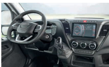
» Extensively equipped driver's cab