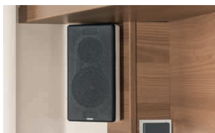
» Sound system (option)