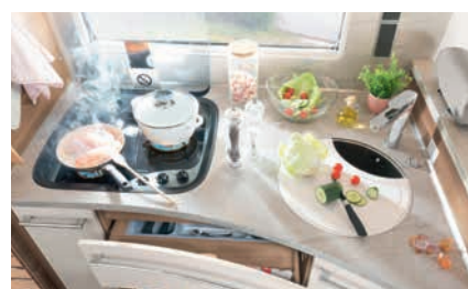
» Large kitchen worktop with extra space for the coffee machine