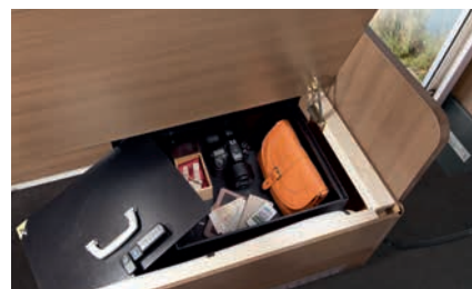
» Anti-theft safe