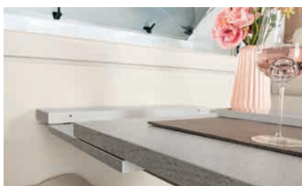
» Table top extension