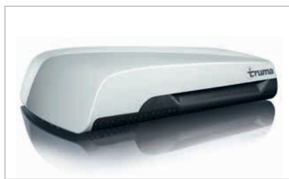
» Powerful roof air conditioner (option)