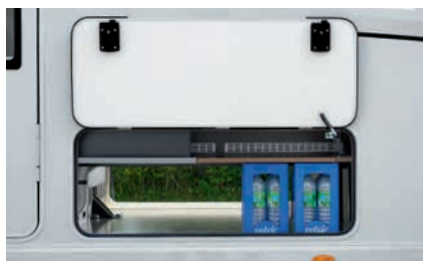
» Storage space in the double floor