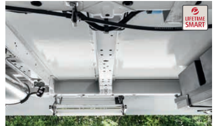
» Wood-free and rot-free Lifetime Smart floor construction (covered with GRP).