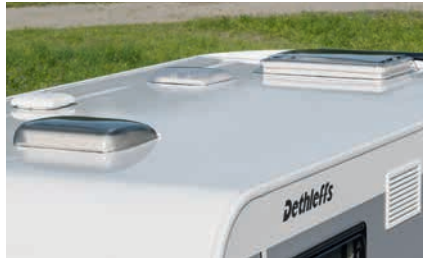
» Well-protected against hail: durable GRP roof.