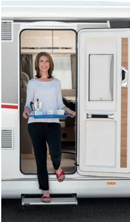
» Extra-wide entrance door (70 cm) (not for T/I 1) with flyscreen door.