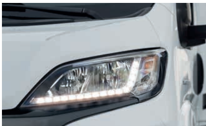
» T: Stylish safety feature: LED daytime running lights.