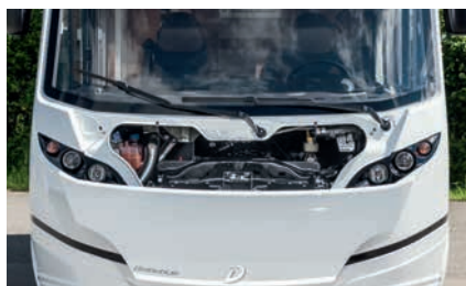
» I: Easy to service: large engine bay opening for servicing all relevant parts.