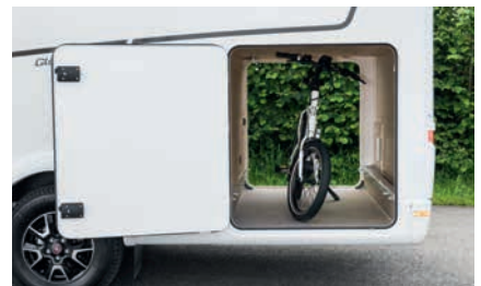
» High garage with 150 kg loading capacity