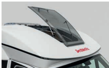
» T: Large opening skylight in T-hood.