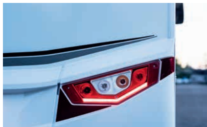
» Prominent and safe: Integral rear lights with LED night-time-running lights.