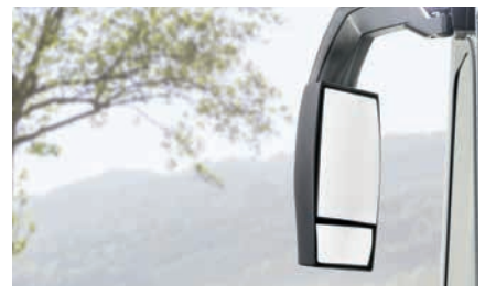
» I: Coach-style mirrors for an unobstructed field of view.