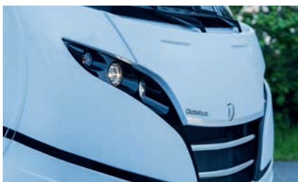
» I: Prominent headlights, elegantly integrated in the new design.