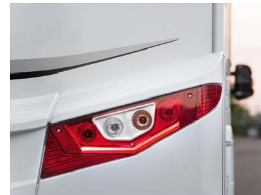
Distinctive and safe: integrated rear lights with LED light strip