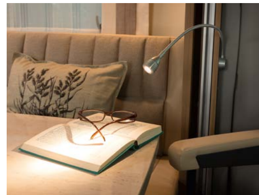
The elegant gooseneck reading lamp brings the light exactly where you need it