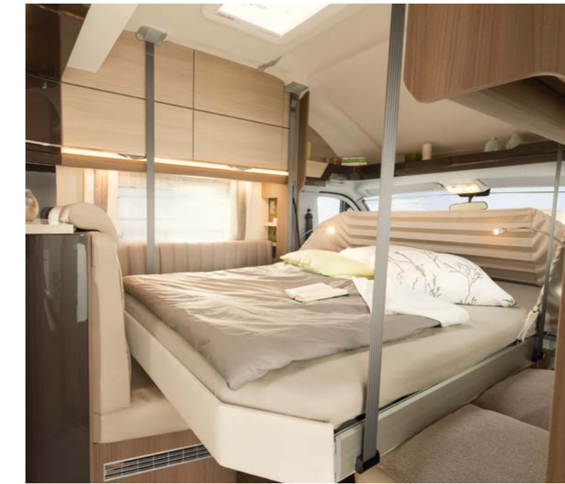
In its lowest position the pull-down bed goes right down to the level of the seats, so getting into bed is easy. And the ergonomic 7-zone EvoPoreHRC mattress guarantees maximum sleeping comfort.