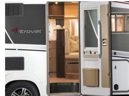
Extra wide living room door (70 cm) - available with windows and central locking