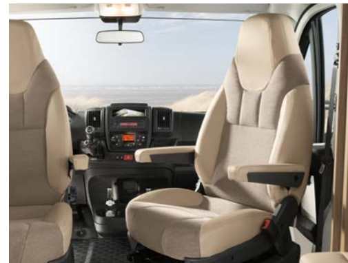
Comfortable Pilote seats with height and tilt adjustment and upholstered armrests