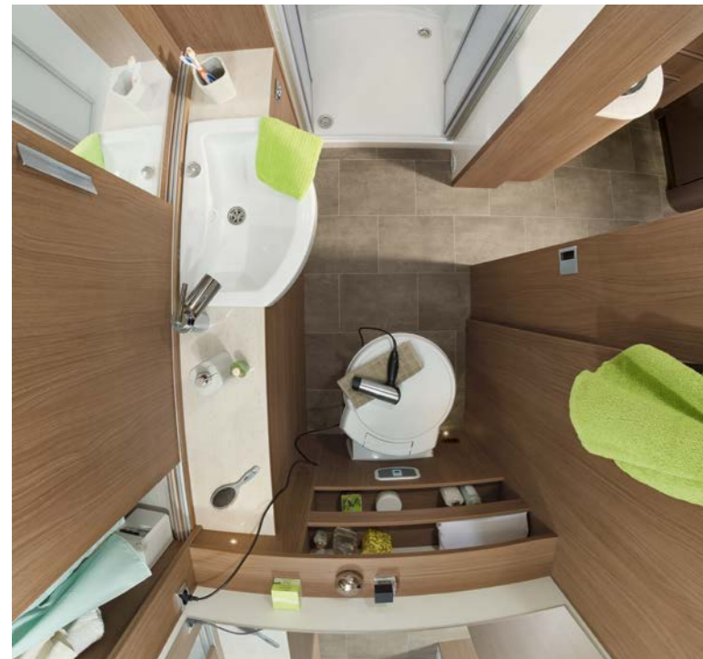
The en-suite bathroom in the rear of the vehicle offers a lot of freedom of movement. In addition to a plastic-panelled shower cubicle, it offers a fully-fledged wardrobe which at the same time serves as a dressing room.