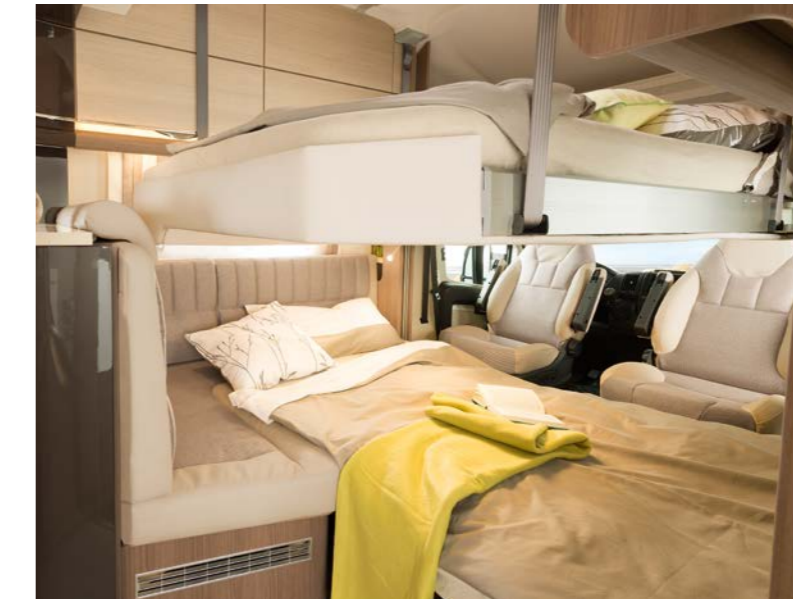
There is even enough headroom when the pull-down bed is in its intermediate position. The convertible seating area can be used as additional sleeping space.