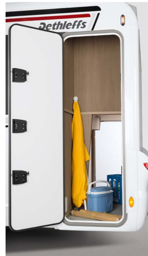
The high exterior compartment with drip tray is handy for transporting tall objects such as skis etc.