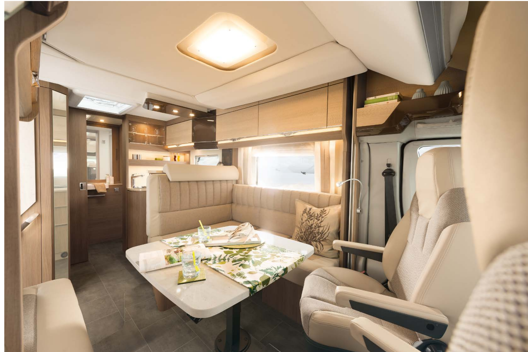
Although the T 6966-4 is only 699 cm long, it includes a large bathroom in the rear, a spacious L-shaped kitchen with a 145 litre fridge and an inviting seating area. And despite all that, it still offers a wonderful feeling of open space.

For more information please visit: www.dethleffs.co.uk/4-travel