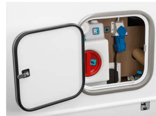
Service access for filling and cleaning the fresh water tank, the 230 volt socket, and emptying the boiler