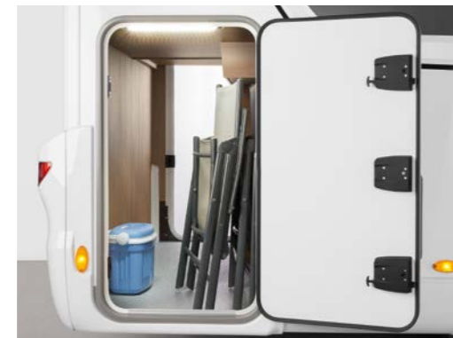
The drop chassis makes it possible to have a high rear garage with through-loading capacity