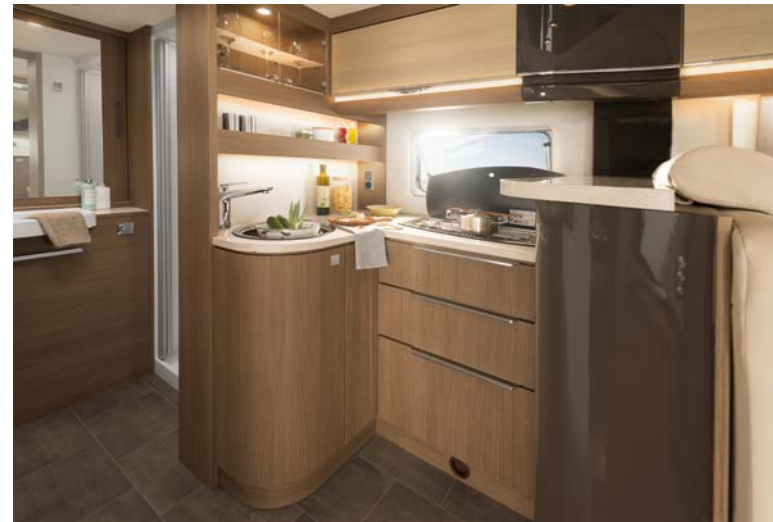
Also featured in the 4-travel: an elegant kitchen centre with a 3-burner stove and large drawers. A special highlight is the glossy room divider facing the seating area with a bistro shelf, bookshelves and an attractive light installation.