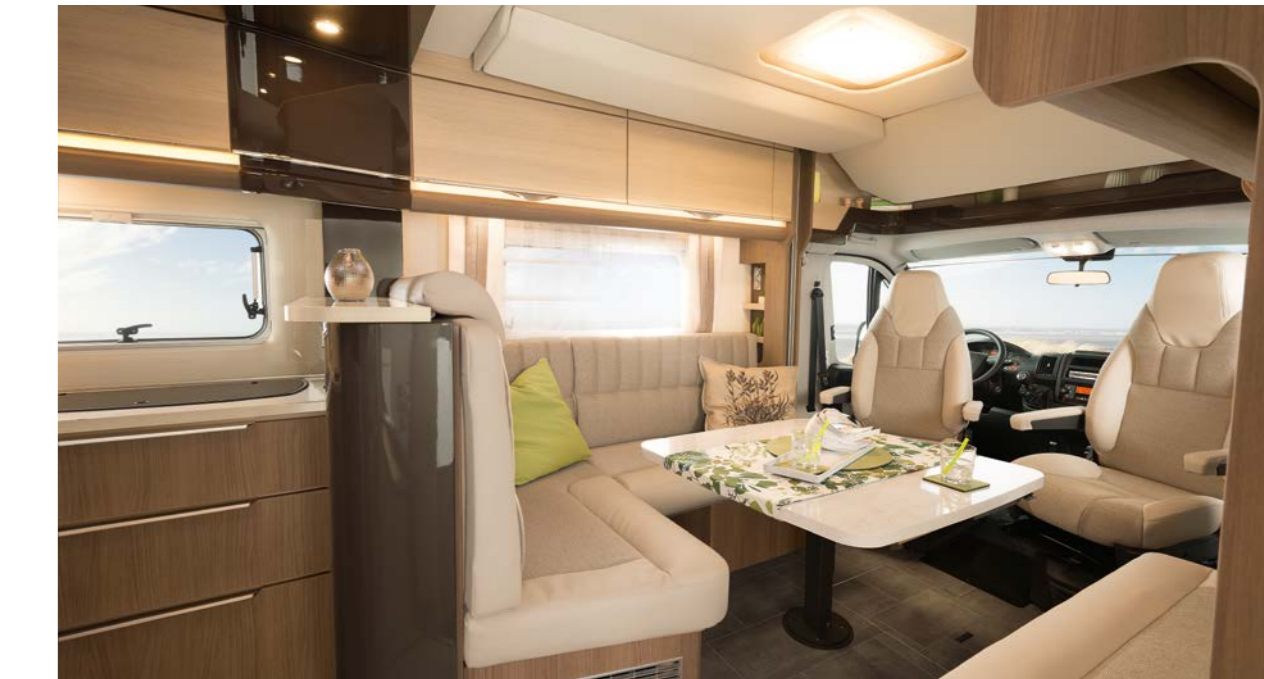
The spacious L-shaped seating arrangement is inviting and modern. Up to five people can be seated at the versatile table. The 4-travel also provides enough headroom under the pull-down bed.

A large skylight which can be opened provides sufficient light and air over the pull-down bed.