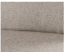
+ Upholstery Heron (partial textile-leather)