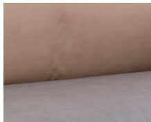
+ Upholstery Duke