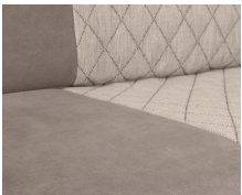
+ Upholstery Jupiter