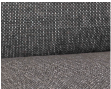
+ Upholstery Floyd