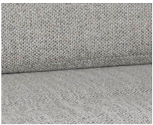
+ Upholstery Samir